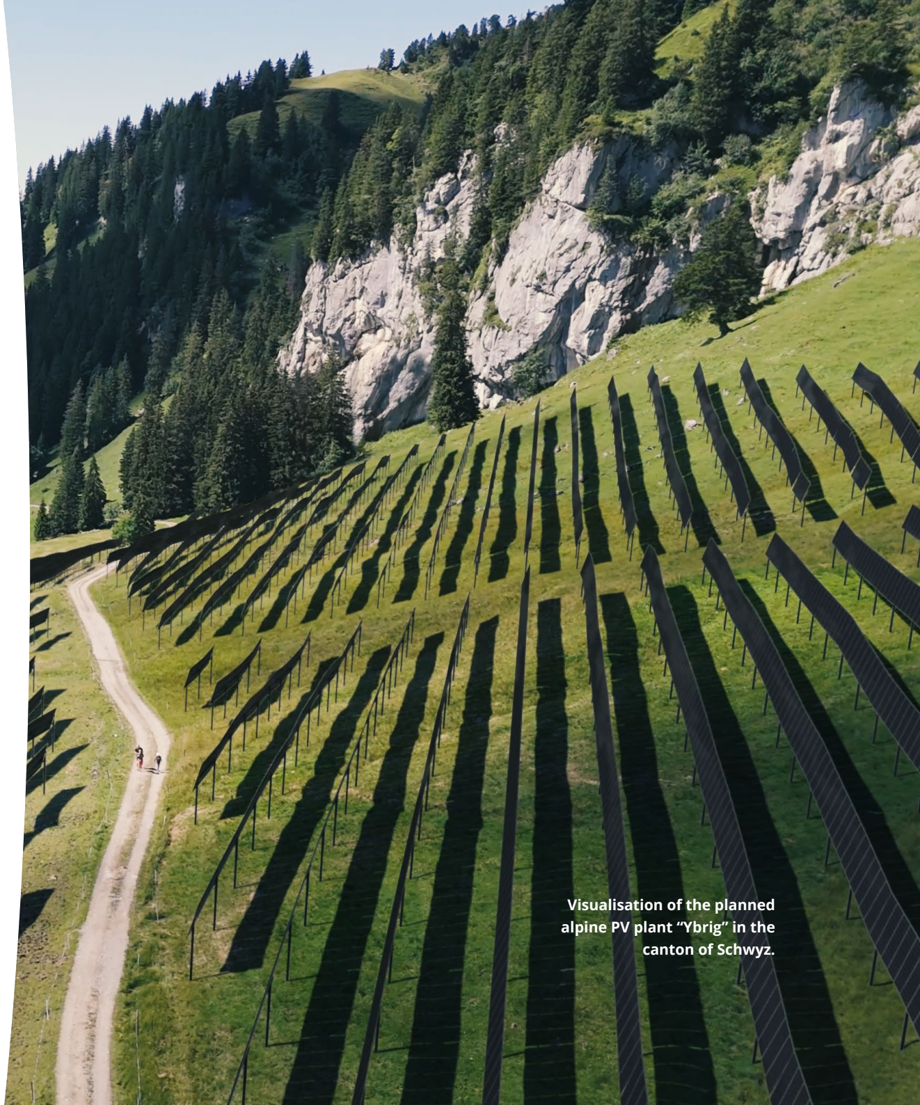
Visualisation of the planned alpine PV plant "Ybrig" in the canton of Schwyz.

In addition to roof-mounted systems, Axpo is also planning the expansion of ground-mounted systems in the midlands. Such systems have already been implemented successfully at substations, and more are planned for the coming months and years. These projects will not only contribute to meeting the demand for sustainable electricity in urban regions, but also help accelerate the energy transition across Switzerland.