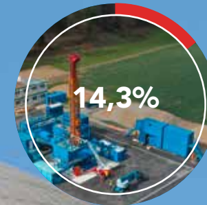
National Cooperative for the Disposal of Radioactive Waste (Nagra) Direct shares Axpo Power (excluding indirect shares through KKL, KKG and Zwilag)