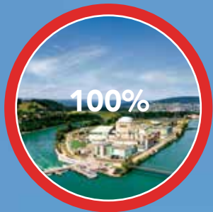
Beznau nuclear power plant (KKB)