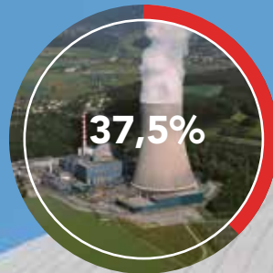
Gösgen nuclear power plant (KKG) Direct shares Axpo Power and CKW