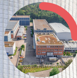
Interim Storage Facility Würenlingen AG (Zwilag)

Direct shares Axpo Power (excluding indirect shares through partner plants of KKL and KKG)