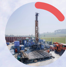
National Cooperative for the Disposal of Radioactive Waste (Nagra)

Direct shares Axpo Power (excluding indirect shares through KKL, KKG and Zwilag)