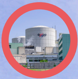
Beznau nuclear power plant (KKB)