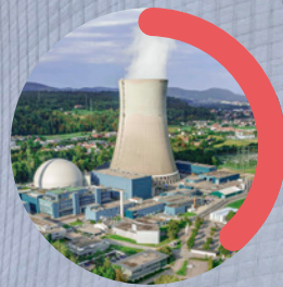
Gösgen nuclear power plant (KKG)