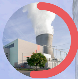
Leibstadt nuclear power plant (KKL)

Direct shares Axpo Power, Axpo Solutions and CKW